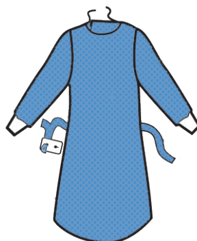
Size M - XXL: PM.2994G