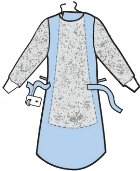
Size M - XXL: PM.1994V

Our GEPCO Surgical Gowns come in a variety of styles and sizes, all of which are carefully hand-crafted and sewn to provide fluid protection between you and your patient. All GEPCO gowns are ready-to-use in convenient, sterile peel pouches to save you time, increase efficiency, and reduce potential for infection.